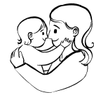
Hang Out With Mom Association