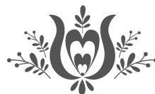
Antal Pantó Traditional Preservation Association